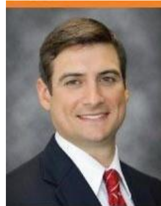
Miller-Valentine Group Realty Services