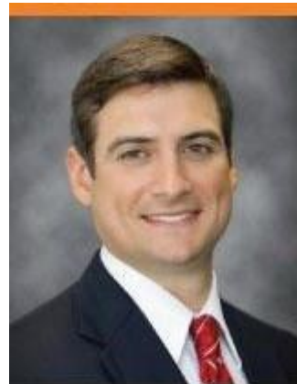
Miller-Valentine Group Realty Services