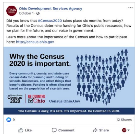
An example of promoting the Census on social media.