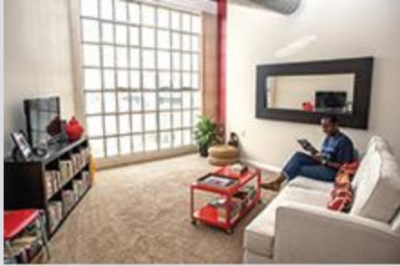
Oregon District - 1:30 p.m. (Link tour) and 3 p.m. (walking tour)